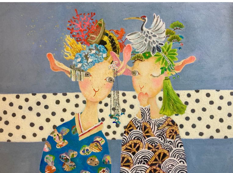
It's a secret between us Technique: Oil painting on canvas Dimensions: 33.3x24.2 cm