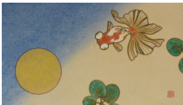
Water Moon 1

His painting is stylistic, and his theme is between fantasy and realism. We can see his understanding of classic Japanese paintings, and he applies it to modern painting: decorative, fantastic, and Japanese.